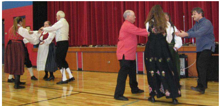
THE LYKKERINGEN NORWEGIAN FOLK DANCERS -- ADULTS