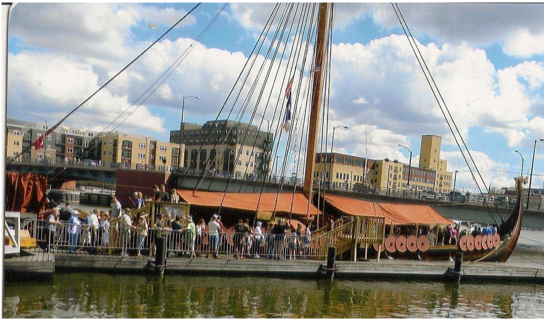
PHOTO OF THE DRAKEN HARALD HÅRFAGRE , THE NEW VIKING SHIP REPLICA AT THE AUGUST 2016 GREEN BAY TALL SHIP FESTIVAL