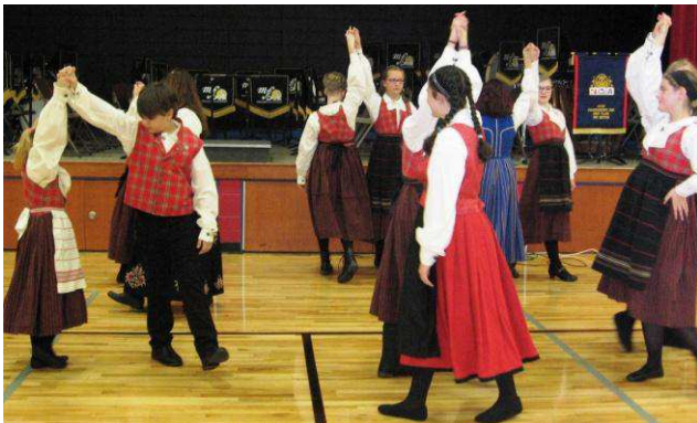
THE LYKKERINGEN NORWEGIAN FOLK DANCERS -- YOUTH