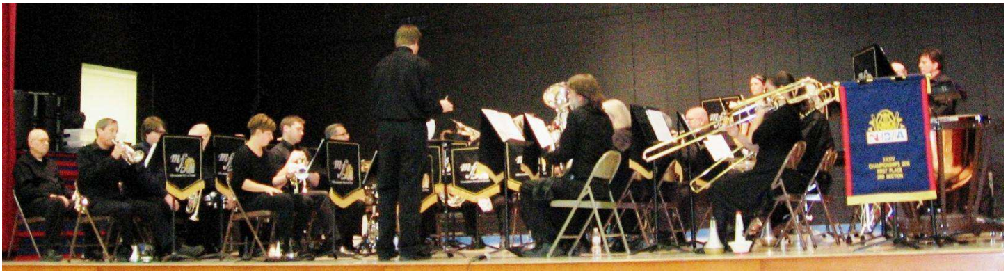
MILWAUKEE FESTIVAL BRASS, THE FEATURED ENTERTAINMENT FOR THE FESTIVAL