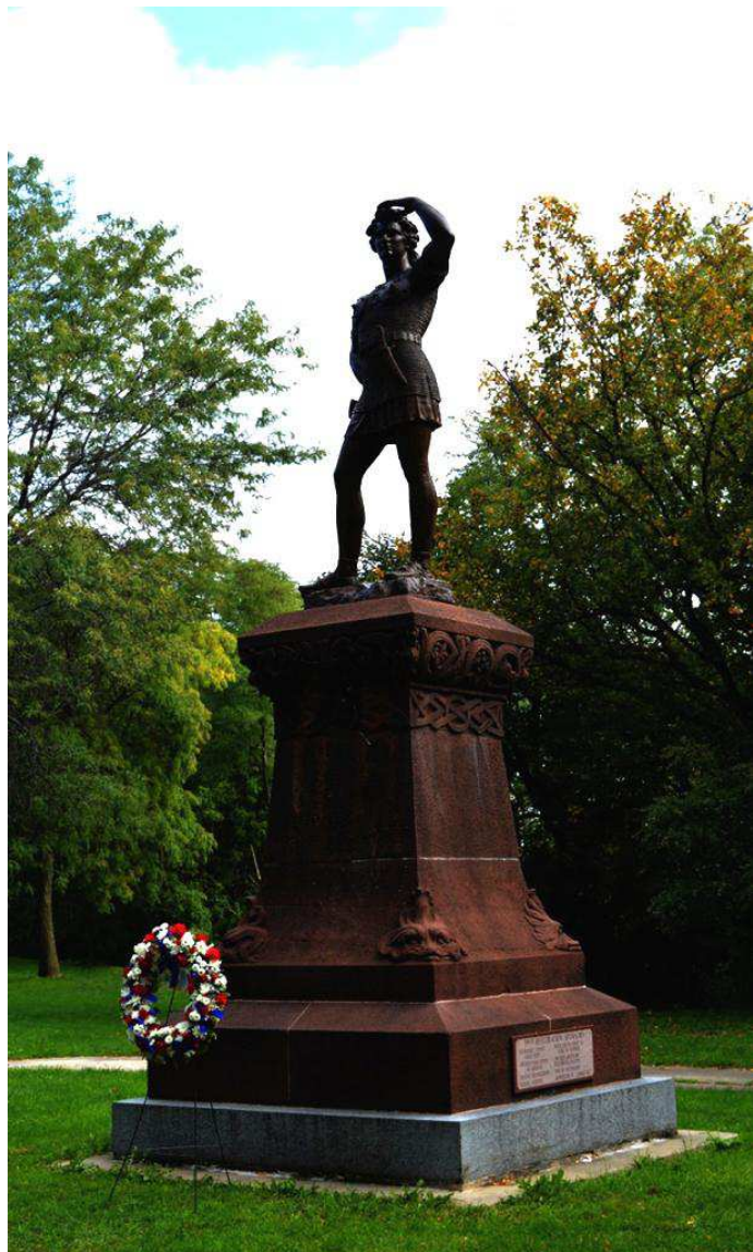
WREATH NEXT TO THE LEIF ERIKSON STATUE IN JUNEAU PARK IN MILWAUKEE