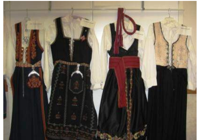
SOME OF THE MANY NORWEGIAN BUNADS ON DISPLAY