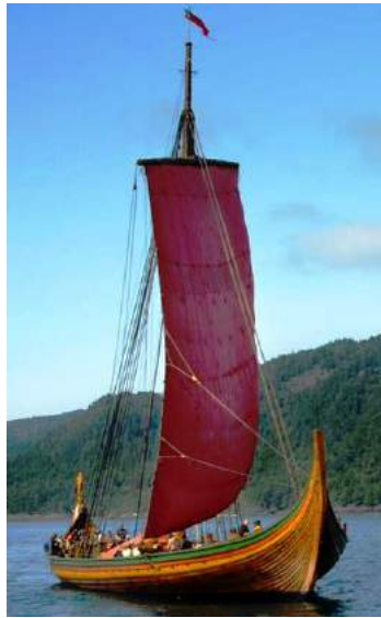
The above photo of the Draken Harald Hårfagre was found at http://tallshipgreenbay.com/