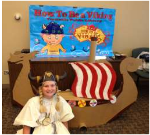
"How to Be a Viking" 2016 July 7, 14 and 21

Ship arrives at Navy Pier July 27 – July 31 2016 See article on page 2