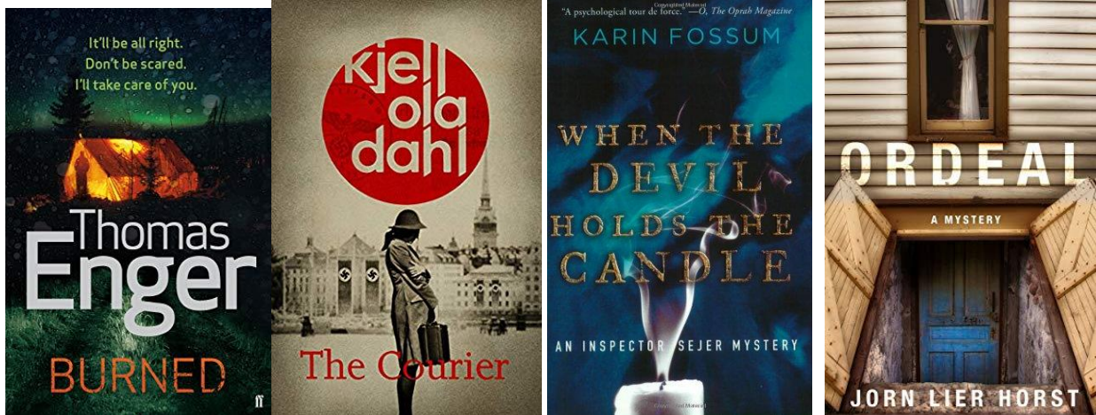
Four Påskekrim boker (Easter books) to read by Norwegian authors