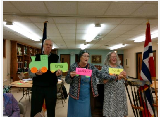
ALL ABOARD!! The Norske språktime language train