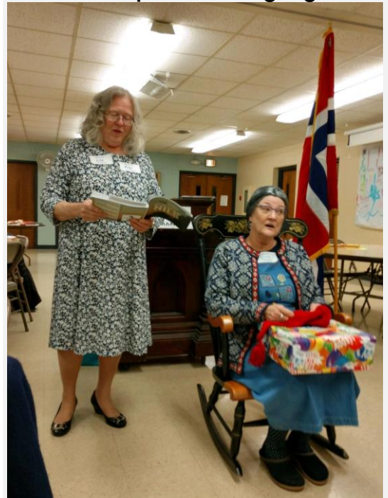
Erna has a secret? Discover the Mystery of Nils. See page 4 for lesson details