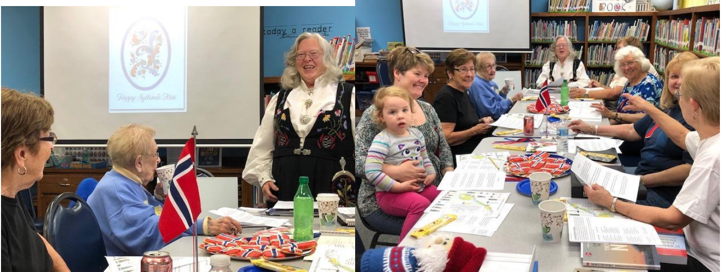
Norske språktuderende feirer 17. mai