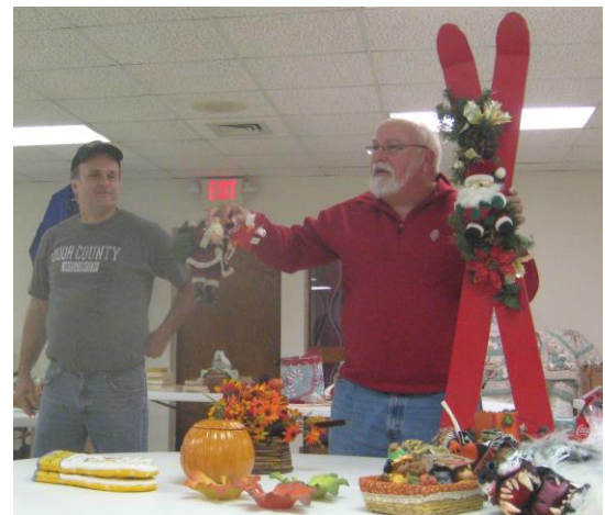
Last year's fund raising auction.

For us, many things have returned to normal, almost. We got baby chicks in September and spent last week butchering. Praise God we have a freezer full of chicken, corn, spinach, pumpkin, and apple cider with potatoes, onions, butternut squash, apples, and carrots stored in the garage. I don't think we will go hungry anytime soon. I have been subbing at school, and we are attending services at our church. I help with modified Awana and youth group on Wednesday nights, and I've even been able to do my water exercise class once a week. But I'm still waiting to be able meet with friends somewhere inside when we can actually be close enough to really see each other. Keeping distance and wearing masks is getting old, but, thankfully, we have been safe and healthy. Prayers for a safe and healthy Thanksgiving and Christmas.