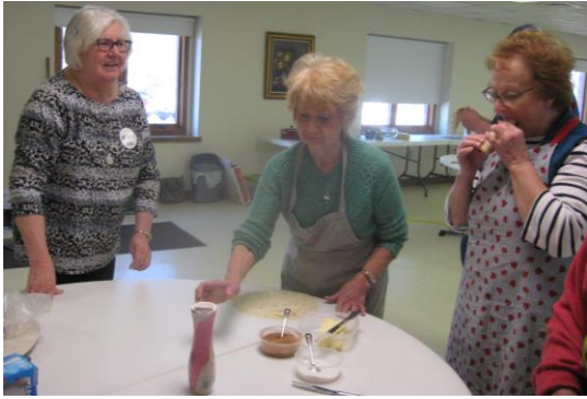
Making lefse May 2020

Hello, Sons of Norway friends! Are you wondering how you will survive this fall without our annual lefse bake? If so, this fall will be a great time to hone your lefse baking skills at home. Just one or two batches should do it. I met a new friend that has experience making lefse, so we started making plans to do our own little lefse making party. Now that is on hold for a while since my new cupboards are ready to be installed. So, if any of you make your own this year, remember me. I also eat rejects. The other thing I really missed is the Sons of Norway auction. The last couple of years I bought some planters with plants in them. Believe it or not, they haven't died. The red shamrock wasn't doing too well last year, so I transplanted some of it to another pot, then that left the rest in the garage over the winter.