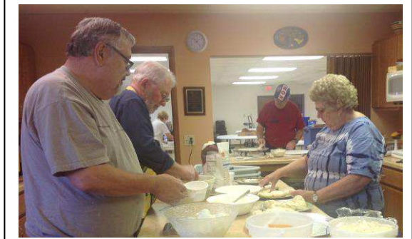
The kitchen crew mixes the dough and shapes it into "pucks." (The UPC kitchen is certified by Public Health.)