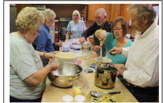
This crew riced potatoes the day before baking.

Lefse was frozen and sold at our bake sale December 9.