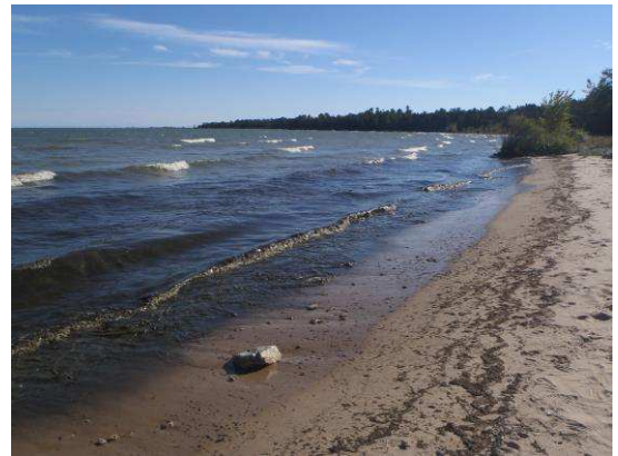
Lake Michigan Shore-Newport Beach State Park Door County and Washington Island are almost surrounded by water like the fjords and the ocean.

A visit to Rawley's resort was like a mini trip to one of the old mountain hotels in Norway with a Swedish theme, a log interior, carved painted shutters and a fish boil right across from the harbor complete with a retired professor telling stories of the history of the area while the fish boiled. There are lots of activities at the resort. There are even cabins for rent if you prefer that to the hotel rooms.