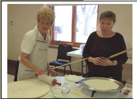
Next, some roll out dough. Some flip to bake both sides of lefse on the griddle.