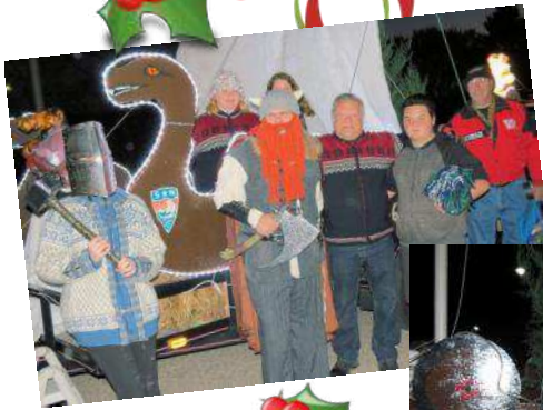
RACINE'S HOLIDAY PARADE