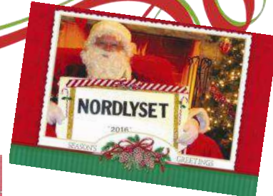
Our lodge has its own St. Nick!