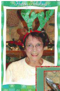
OUR ANNUAL CHRISTMAS PARTY