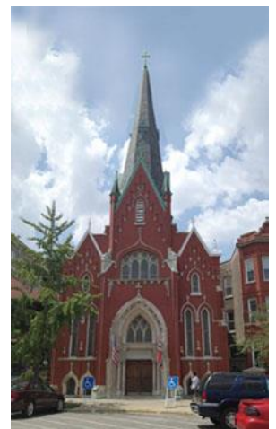
Chicago Minnekirke

Med vennlig hilsen (With best regards), Louise Giles