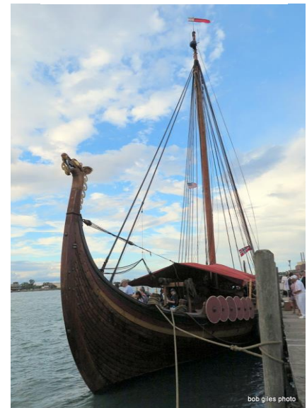
Viking ship on the Detroit River

We hope you will mark your calendar and join your fellow members at this meeting on Sunday, October 23th, at the Swedish Club at 22398 Ruth Street in Farmington Hills.