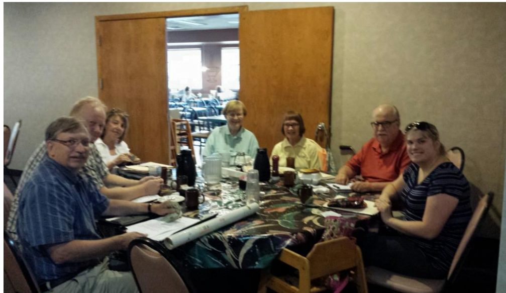
Your Nordkap Board in session