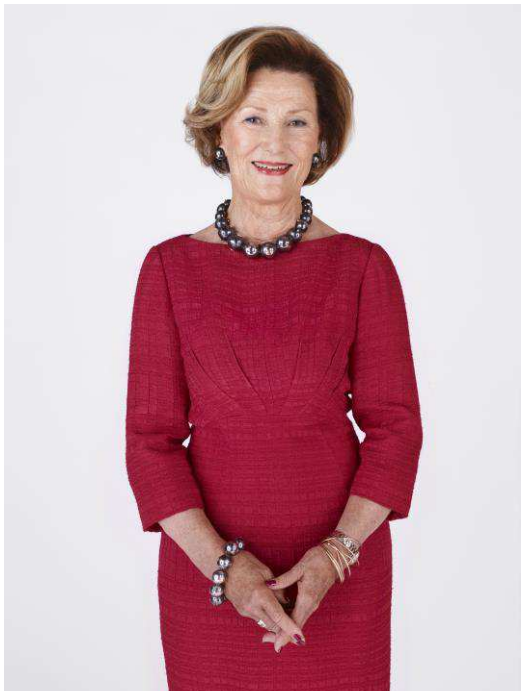
H.M. Queen Sonja

Just weeks ago, the disassembled 1930s childhood home of H.M. Queen Sonja of Norway was moved from its