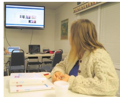
Norwegian class student