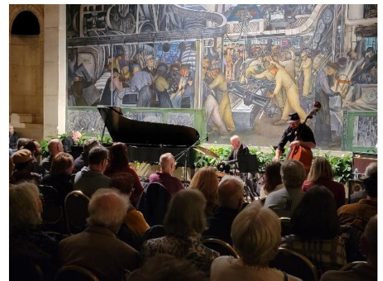
DIA concert