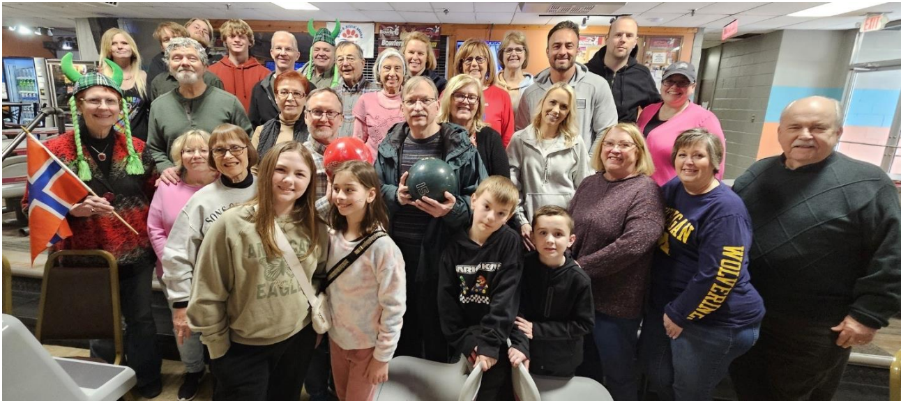
The 2024 Nordkap Bowlers