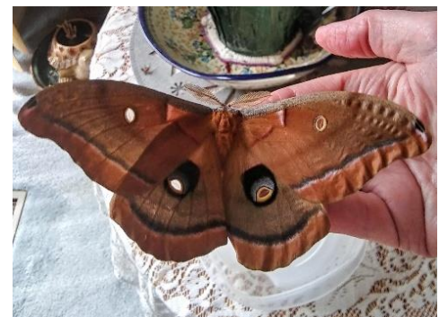
Polyphemus moth

Once weather warmed up outside, Carmen released the moth, which has no mouthparts and doesn't eat. Thus it could fulfill his natural mission -- to find a female, to mate, and sadly to die in about 4 days.