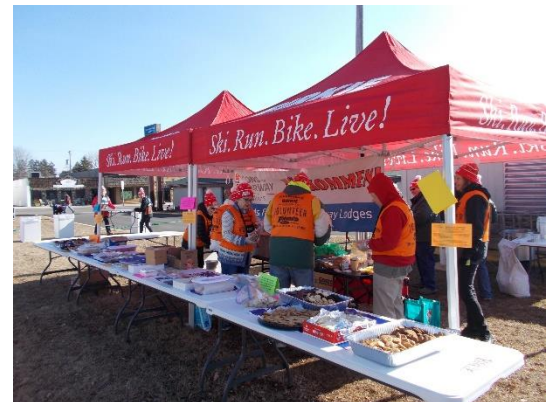
Cookie Tent

The 433 children were challenged with a running race which ended in downtown Hayward, just a few steps away from the Sons of Norway cookie tent. There, 5th District volunteers distributed a total of 601.5 dozen cookies, donated by 13 Sons of Norway lodges. The lodge contributing the most cookies was Mandt Lodge in Stoughton, Wisconsin, with 110.5 dozen cookies! Nordkap was among the 11 lodges contributing money to help with the effort.