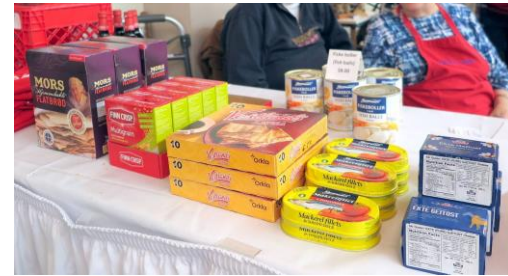
Typical Import Store Items

Samples of home-made potato lefse created in Mary Morehead's cooking class will also be offered.