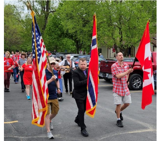
Last year's Syttende Mai parade