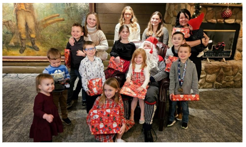
The Julenisse and kids gather before the fireplace.