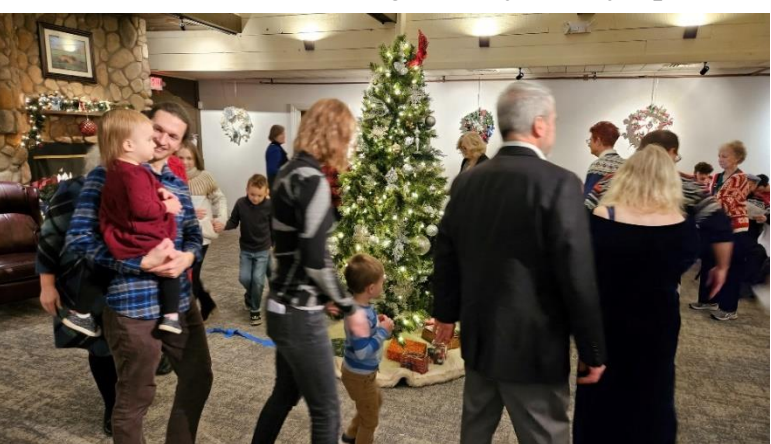
Dancers circle the tree.