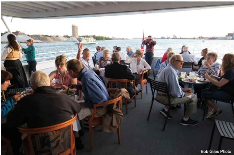
Enjoying the view from the upper deck.