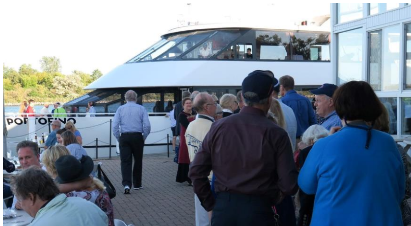
Boarding our chartered yacht.