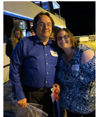
Smiles at journey's end.