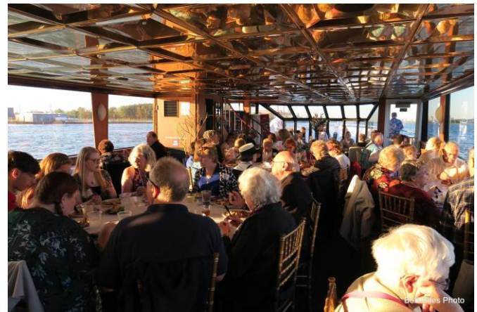
Main deck diners have loads of sunshine.