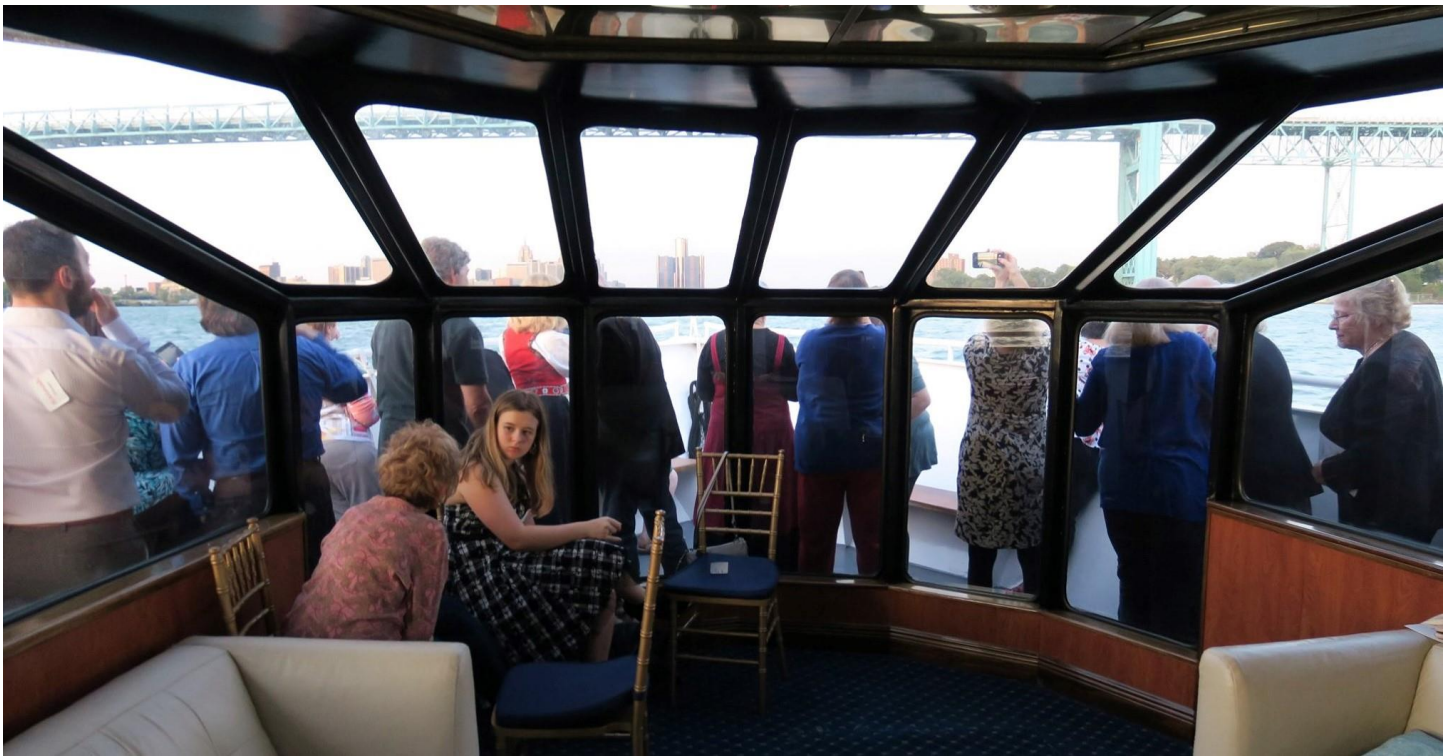
Guests gather on deck for our passage under the Ambassador Bridge.