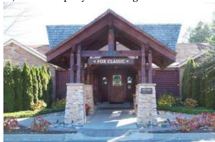
Fox Classic

The facility at 8768 North Territorial Road, Plymouth Township, is easily accessible by major surface roads and area freeways. More details will be coming in later editions of this newsletter.