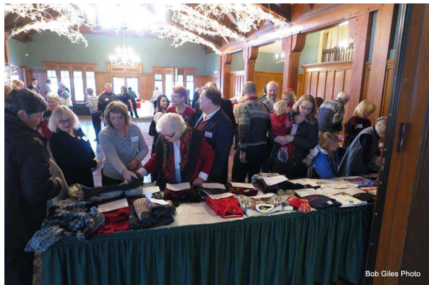
Norwegian-style sweaters drew bidders at Nordkap's silent auction.

The money is most welcome, since Nordkap awarded five scholarships of $750 each in 2017 and expects many applicants in 2018.