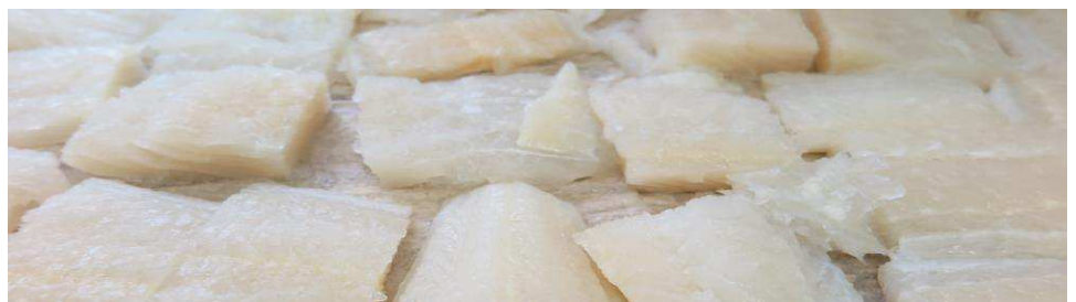
Lutefisk: Try this traditional food as an appetizer in January.