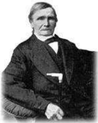
Cleng Peerson (1783-1865) (historic photo)

The voyage continued on August 7 th when Restaurasjonen left the harbor in Funchal and on October 9 th , she entered the harbor in New York, now with 53 people. In New York the ship, cargo and captain were taken under arrest due to a violation of the 1819 Passenger Act. For a vessel her size, Restaurasjonen had far more passengers than allowed by the American law. However, the arrival of this small ship attracted attention in New York. This was the smallest ship known to have crossed the Atlantic with emigrants. In New York the sloopers were met by Cleng Peerson, and it is likely that his connection with the Quaker community in New York was a help in getting the case against the sloopers dropped. When the ship and cargo were sold, they only got 400 Dollars, which was less than half of what they had paid for it in Norway. The money they got for the ship and cargo was supposed to be their investment capital in the new country.