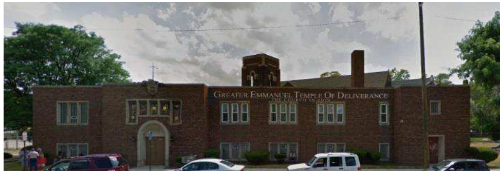
Today’s Greater Emmanuel Temple of Deliverance