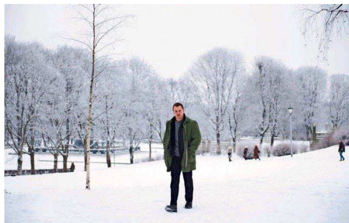
Michael Fassbender in "The Snowman" (film still)

Filming: Scenes in Oslo included one on the tram with Fassbender, a party scene at Oslo City Hall, and Restaurant Schrøder, where Harry Hole is a regular in the book-series. Shooting also included the area of Rjukan (where the heavy-water incident in World War II took place) and the city of Bergen, featuring such locations as the mountain of Ulriken, Bryggen and Skansen firestation. Scenes were also shot in Drammen and on the Atlantic Ocean Road.