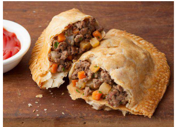
Beef Pasty

We'll feast on pasties— that delicious hot meat pie that explorers might have enjoyed, if they'd only had them! Pasties actually came from Cornwall, England, where the miners carried them in their pockets for a hot lunch underground.