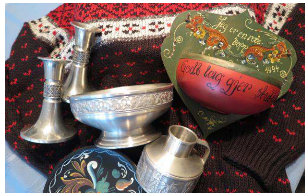
Auction items to date include sweaters, Norwegian pewter, and rosemaling.