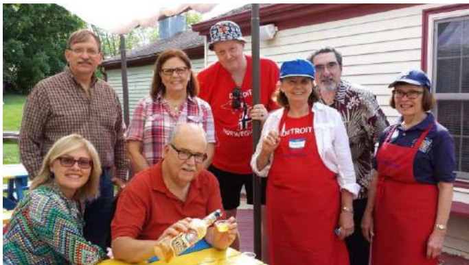
The clean-up crew enjoys a taste of Norwegian Linie Aquavit after a long day at the Steak and Corn Roast.

Also with fall comes the election—our lodge election, in this case. On October 23, we'll report the progress of our nominating committee in seeking new officer candidates. There is still time for you to help Nordkap reach its highest potential. Let us know how you would like to serve, and we'll find a position that meets your interests that you can run for. The elections will be held at our November 20 th gathering.