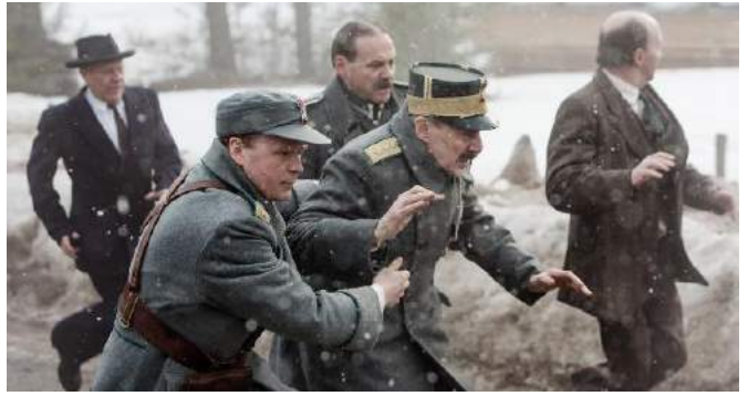
Scene from "The King's Choice"

Yes, it could, because the historical drama, "The King's Choice," is set to represent Norway in the race for foreign-language-film Oscar nominations at the 89th Academy Awards on February 26, 2017.