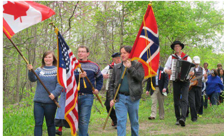
Spirits ran high at last year’s Syttende Mai parade.

Be sure to bring your kids, noisemakers, and Norwegian flags (or buy flags at our general store) for the parade around the beautiful Swedish Club grounds.