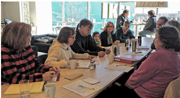
Nordkap Board meeting at IKEA cafeteria