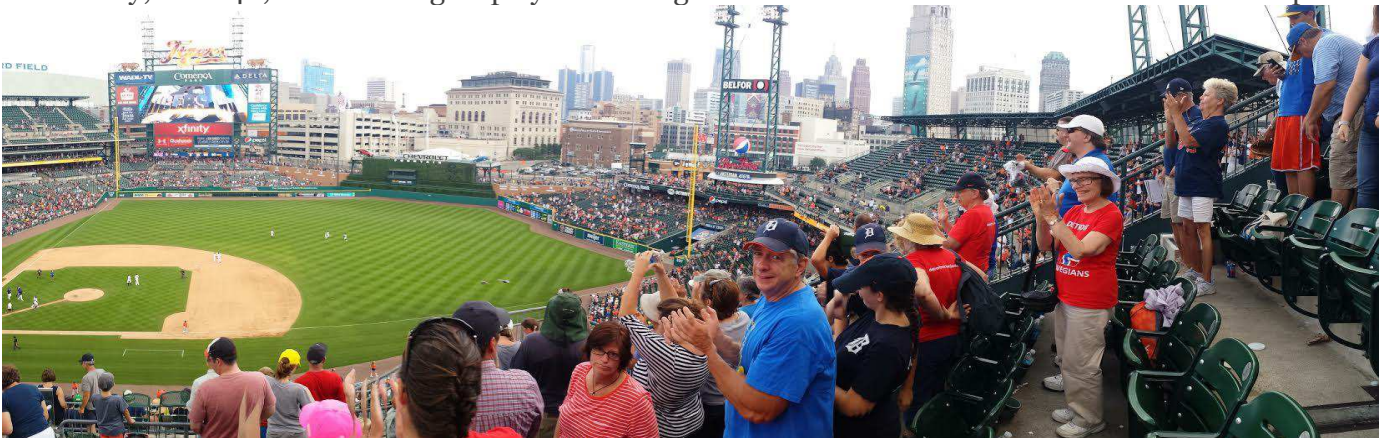
Nordkap joined in cheering the Tigers to a win over the Houston Astros at last year's game.

Back by popular demand, Nordkap’s fourth annual group outing to a Detroit Tigers baseball game has been set for Sunday, June 4 th , when the Tigers play the Chicago White Sox at Detroit’s Comerica Park at 1:10 p.m.