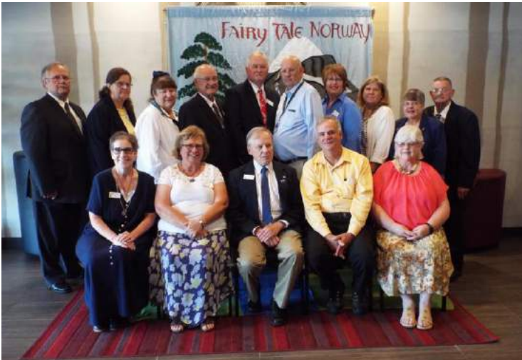
2016 District Board of Directors