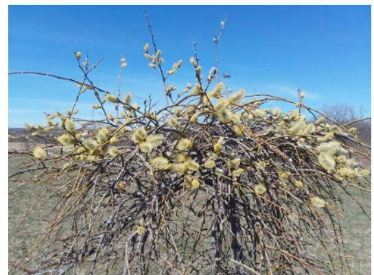
Pussywillows against the glorious blue sky.