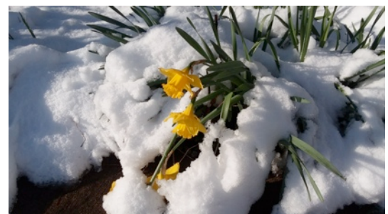
Early daffodils poke up through spring snow.