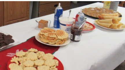
The finished product enjoyed by all: Spritz cookies, Five-of-hearts waffles with savory & sweet toppings, krumkaker and æbleskiver.