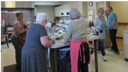
The Spritz Cookie Station