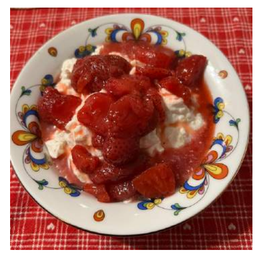
Level 2: Riskrem