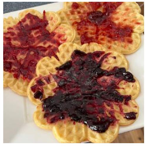
Level 2: Vafler