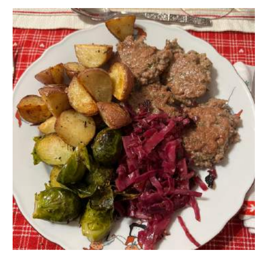
Level 1: Rødkål; Level 3: Kjøttkaker