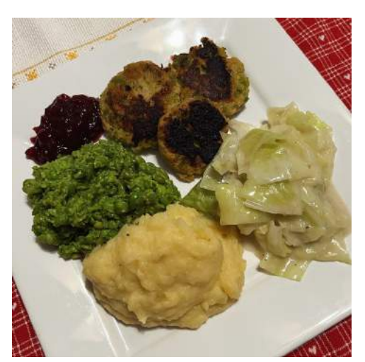
Level 1: Kålrabistappe, Ertestuing, Kålstuing; Level 3: Karbonader