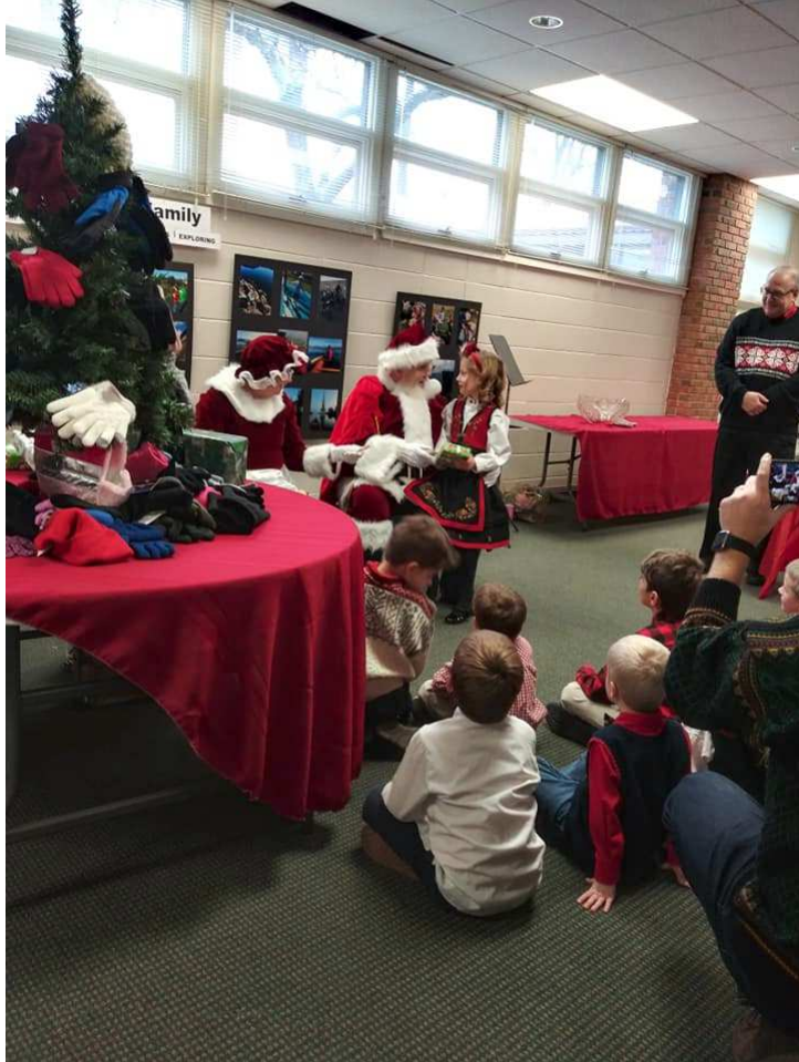
Santa and Mrs. Claus beside mitten tree at Julefest, talking to children and distributing gifts