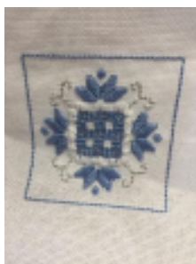
Barb's 1st completed project