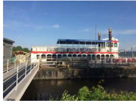
LaCrosse River Boat Cruise