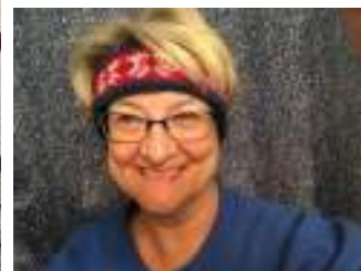
Knitting class headband project