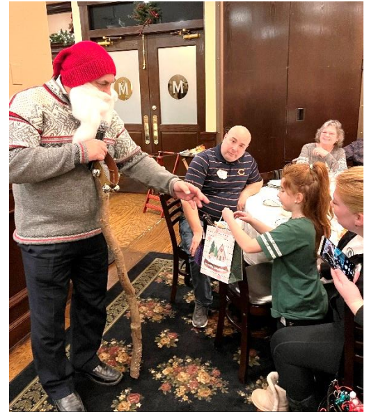
THE JULENISSE VISITED US.