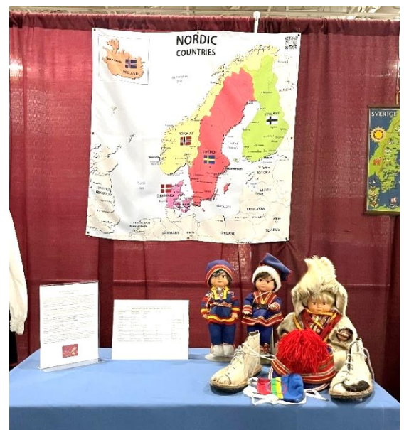
januar og februar 2024