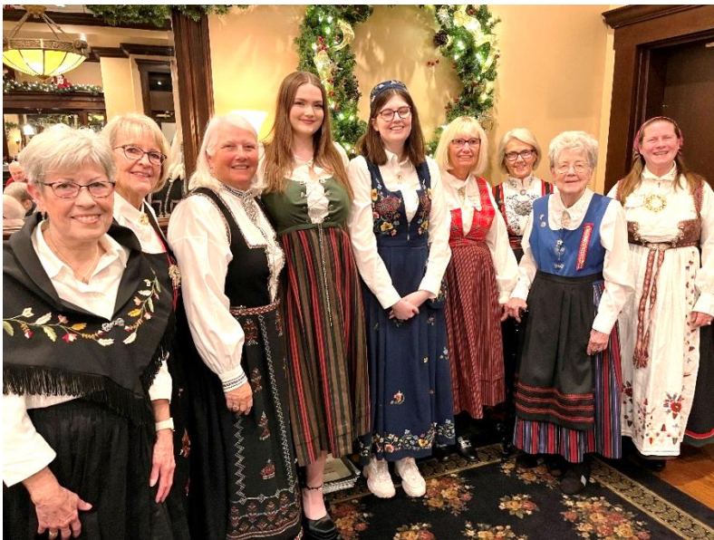
THE LADIES IN THEIR NORWEGIAN BUNADS