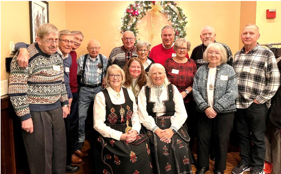
THE ABOVE LODGE OFFICERS WERE INSTALLED FOR THE 2024/2025 TERM AT THE CHRISTMAS PARTY.