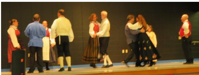
LYKKERINGEN NORWEGIAN FOLK DANCERS