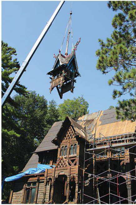
RE-ASSEMBLY IN PROGRESS