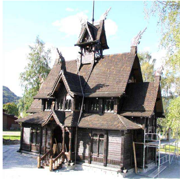
THE CHURCH RE-ASSEMBLY COMPLETED