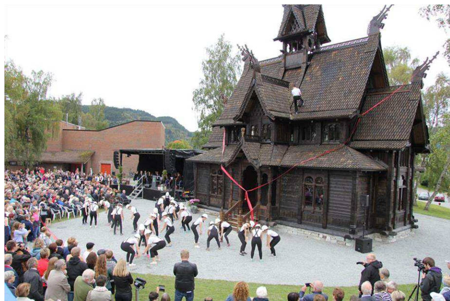
DEDICATION CEREMONY IN ORKDAL, NORWAY IN SEPTEMBER 2017

This replica of a stave church was originally built in Orkdal, Norway for the 1893 World's Columbian Exhibition in Chicago. After the Chicago fair, it was located by the shore of Geneva Lake in Wisconsin until the 1930's, and was then moved to the Little Norway site in Dane County in Wisconsin. After the demise of Little Norway, the building was taken apart in 2015 and shipped to Orkdal, Norway.