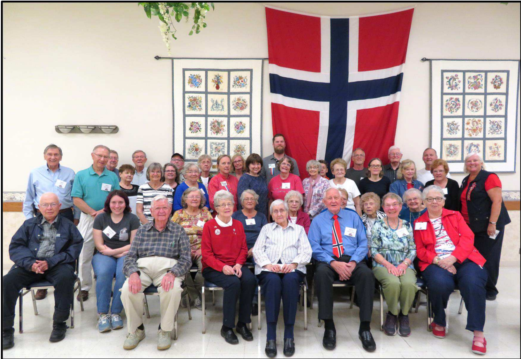
THIS PICTURE OF OUR LODGE MEMBERS BY THE LARGE NORWEGIAN FLAG WAS TAKEN AT OUR SYTTENDE MAI CELEBRATION ON MAY 14 TH AT NORWAY HOUSE.