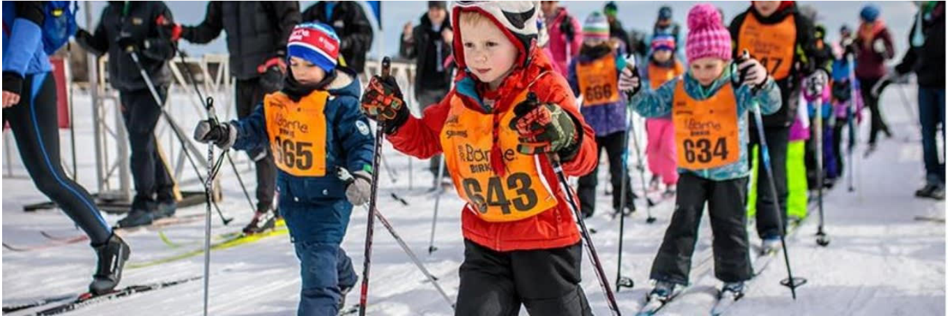
Photo from the Barnebirke website of kids participating in the Barnebirke in Hayward.