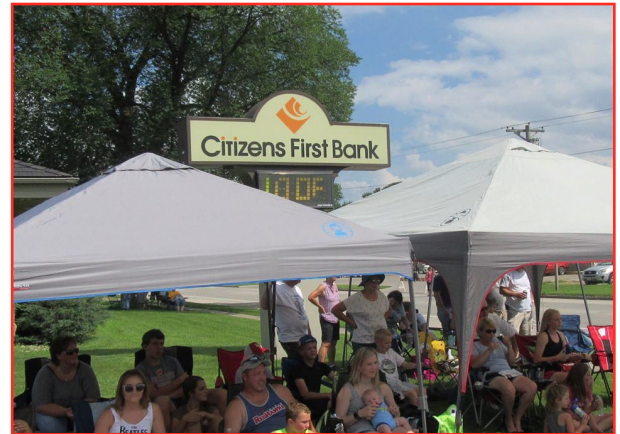
Notice the temperature on the Citizens First Bank sign in Trempealeau during the Trempealeau Catfish Days parade on Sunday, July 15, 2018. Kudos to the brave souls in the photo above who braved the weather to ride our float.