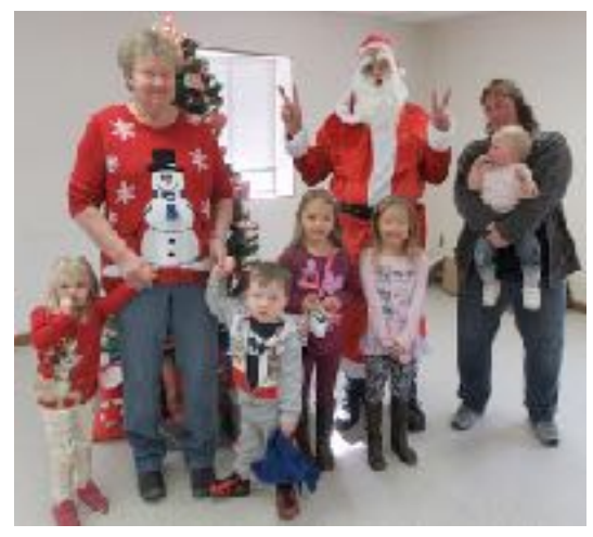
Local children were invited to our December Juletrefest meeting. They had a visit from the Julenisse and the kids also received gifts.