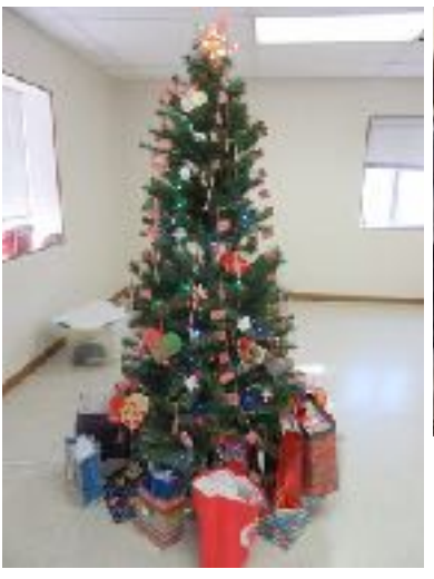
Our 2017 Juletre