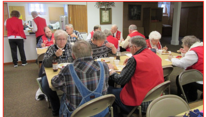
Fagernes Lodge members enjoying a potluck meal at the January 2018 meeting at Zion Lutheran Church, Blair.