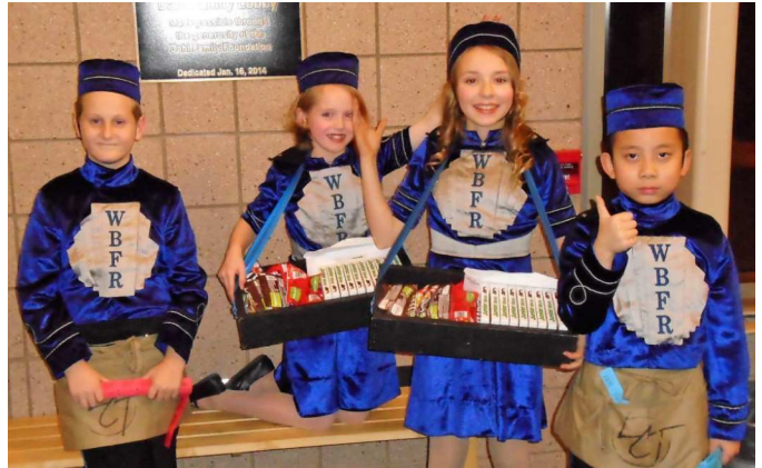
Young actors and actresses from LCT's production of "A Christmas Carol"