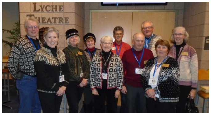
Wergeland Lodge ushers at the December 15 show.