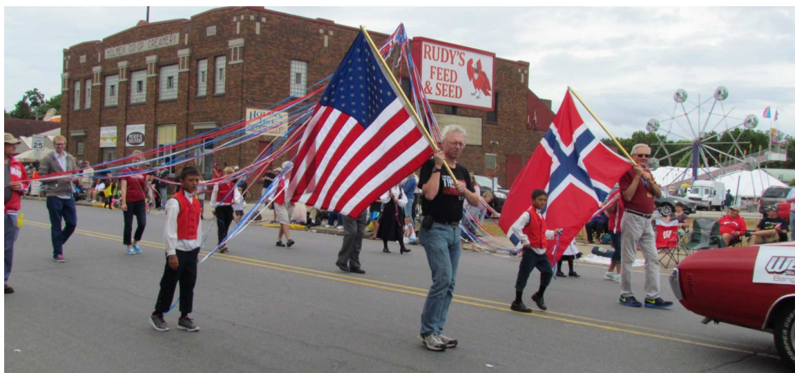
Wergeland members carrying the May pole round out our parade entry. Tusen takk to all who participated.