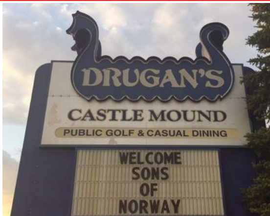
Drugan's Castle Mound welcomes the lodge for our Syttende Mai banquet