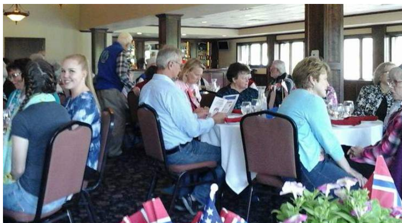
Wergeland members enjoying the Syttende Mai banquet at Drugan's.