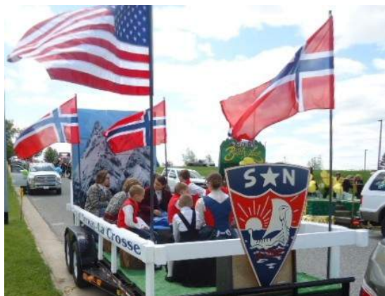
The Wergeland Dancers ready to start the Westby Syttende Mai parade