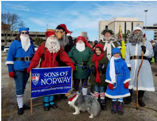
Askeladden Lodge at the November 16 Holiday Parade

This was a joint meeting with the Swedish Vasa Lodge, organized by Vasa. The lecture on the "1893 Viking Ship" was open to the public. About 75 people were present for the lecture.