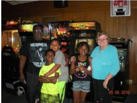
Bowling, May 6, 2016