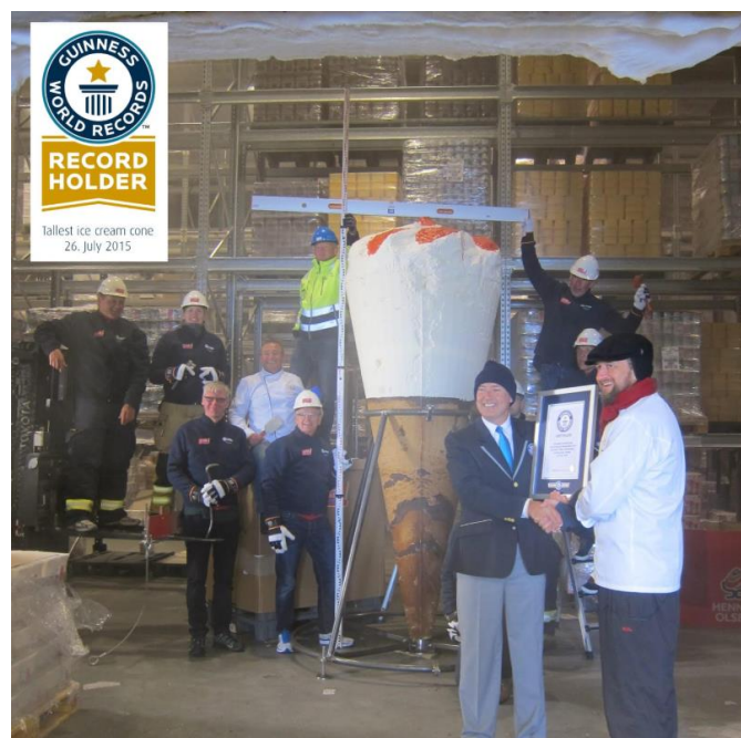
The world's largest ice cream cone

Reading this really makes one hungry for something sweet!